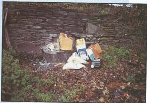
Empty containers should not be left unattended

Empty pesticide containers may not be used for any other purpose. They should be washed immediately, and the washings added to the sprayer tank. After draining, the container should be quarter-filled with water, the cap replaced and the container thoroughly shaken, before draining into the sprayer tank. This procedure should be repeated twice more.