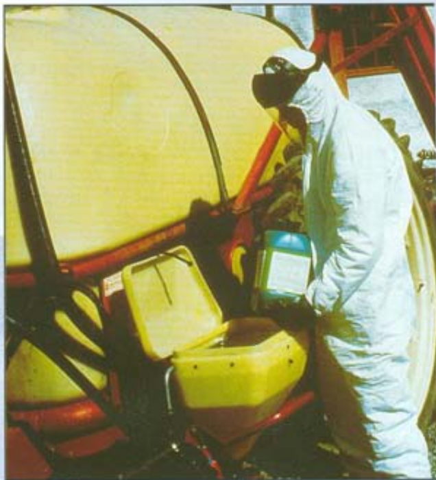
An operator wearing gloves and face protection when pouring pesticide into the sprayer.

It is useful to wear rubber boots, as they will not absorb pesticide.