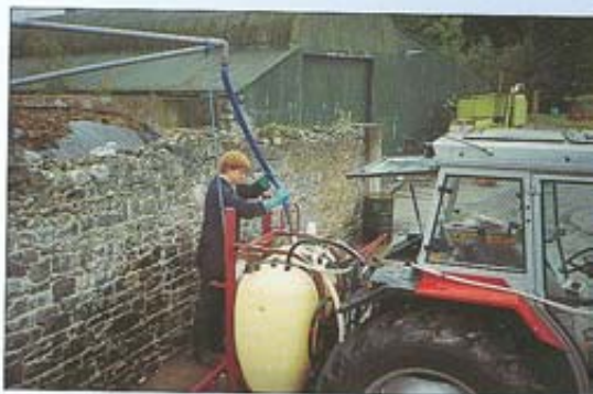
A sprayer filling and washing bay

On the last tank-full, great care should be taken not to mix too much spray. When spraying is finished, a little water should be added to the sprayer and recirculated, and this should be sprayed out on the same crop. The final washing should be carried out on hard-core or soil; avoid washing on concrete that drains to a watercourse.