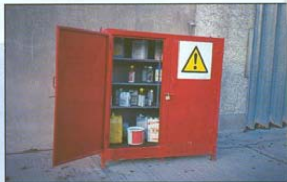
A simple pesticide storage cabinet.