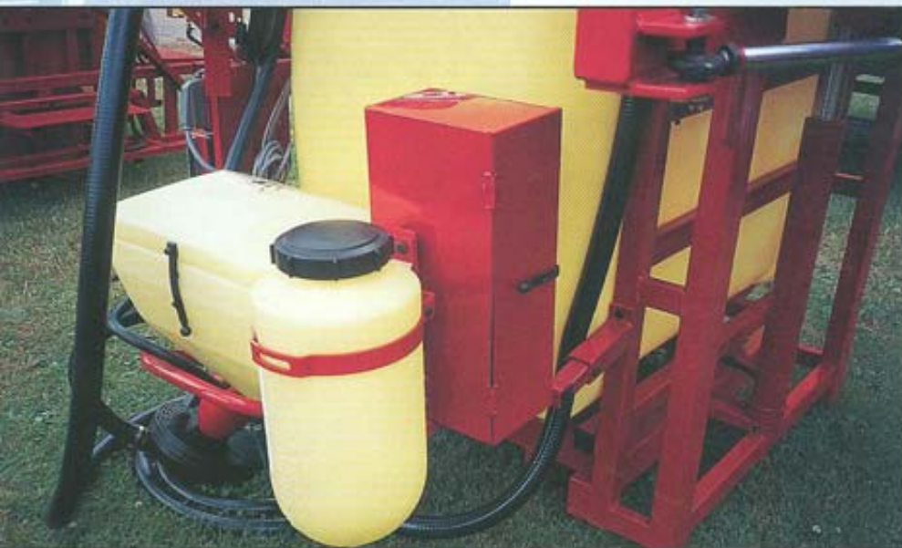
A sprayer fitted with a low level filler, wash water container and box for protective clothing.

T he 1989 Act clearly requires that operators be provided with a sprayer that is in good working order, and that they maintain it in that condition. All power drives should be properly covered, there should be no leaks, and it should be possible for the operator to carry out a spraying operation without undue risk of contamination. It is also important that the machine has a pressure gauge which is reading accurately.