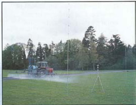
Spray drift measurement at Teagasc, Oak Park.

No matter what precautions are taken, it is inevitable that some droplets of pesticide drift will become air-borne. To avoid contamination of susceptible crops, water-courses, apiaries, gardens or other sensitive areas, untreated strips should be left between these and the treated area.