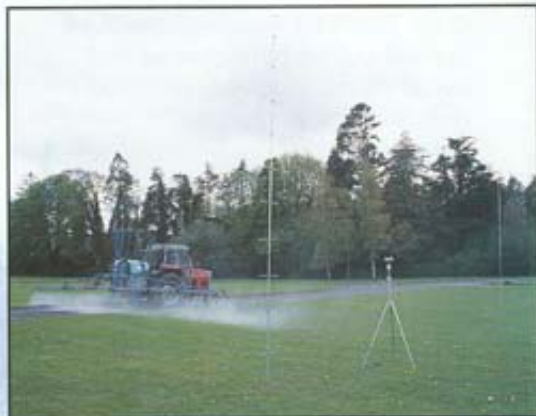
Spray drift measurement at Teagasc, Oak Park.

No matter what precautions are taken, it is inevitable that some droplets of pesticide drift will become air-borne. To avoid contamination of susceptible crops, water-courses, apiaries, gardens or other sensitive areas, untreated strips should be left between these and the treated area.