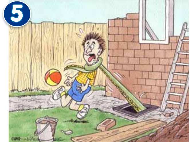
5 Holes or drains left exposed after farm building work should be closed.