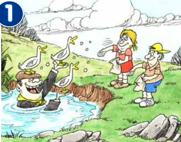
1 Ponds on farms are often out of view of the house so always have an adult with you when you are feeding ducks or playing.