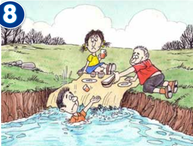
Do not play near the edge of a riverbank as it might crumble away suddenly.