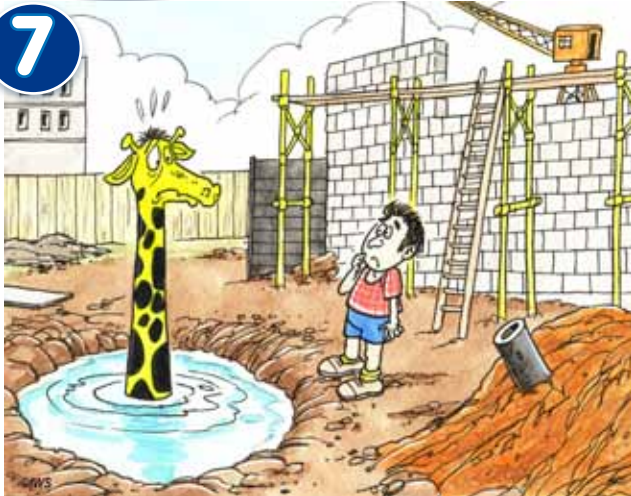
You cannot tell the depth of a hole if it is full of water.