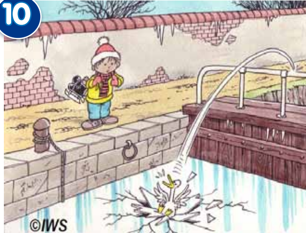
Never walk on ice-covered waterways.