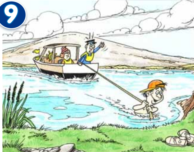
Do not retrieve model boats by wading in.