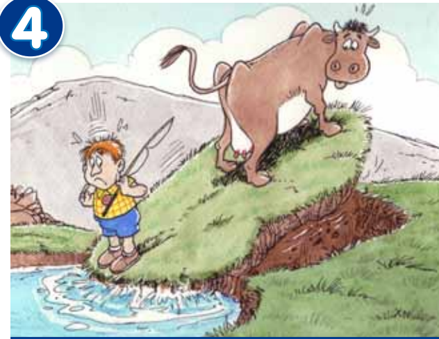
4 The banks of a pond may be weak and could give way under your weight.