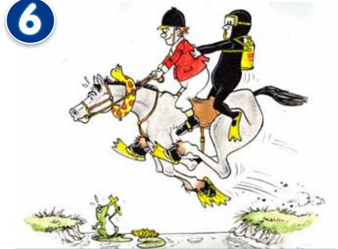
6 Be cautious riding horses near and into water.

Be water-wise on the farm by learning these simple safety steps